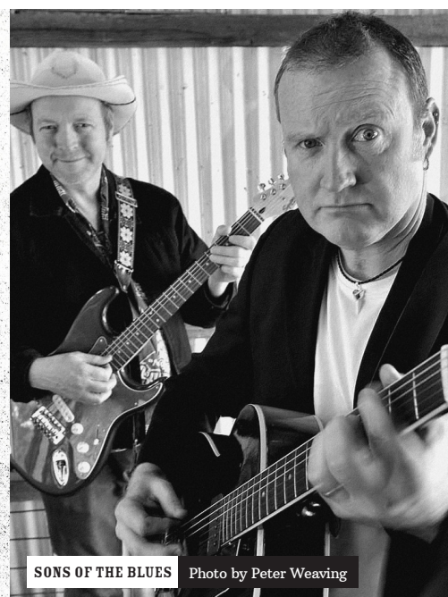
SONS OF THE BLUES

Sons of The Blues have a simple philosophy and core belief. "The music is everything!"